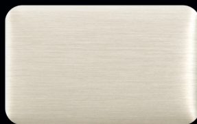
AluNatur PUR-PA Elox Champagne BRUSHED 90F3061.30