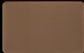
AluNatur PUR-PA Elox Umber TL 90F2969.10