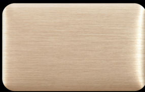
AluNatur HDP Elox Light Umber BRUSHED 90R2967.60