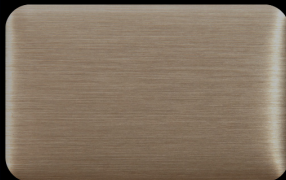
AluNatur PUR-PA Elox Pale Umber BRUSHED 90F2968.10