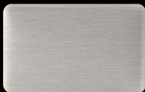
AluNatur PUR-PA Elox Anodized Brushed 90F1054.10

AluNatur Elox is available in Transparent Lacquering (TL) and Brushed aluminium substrates ranging from 0.5 up to 1.5 mm thickness. Whether you want to match EURAS industrial standards or other anodizing standards, all is possible in our new Elox series.