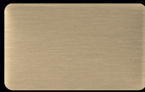
AluNatur HDP Elox Medium Champagne BRUSHED 90R2966.60